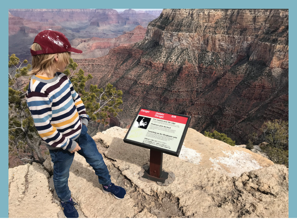
First author's son at South Rim of the Grand Canyon, 2019.

important as learning about volcanoes, geology, and conservation. But as is common for other family visits to free-choice settings, identities can, at times, be in conflict with one another. Even though the author was eager to assume more of an Explorer role, that desire was continually balanced with the needs of his young relatives and his desire to put the perceived interests of his family group first.