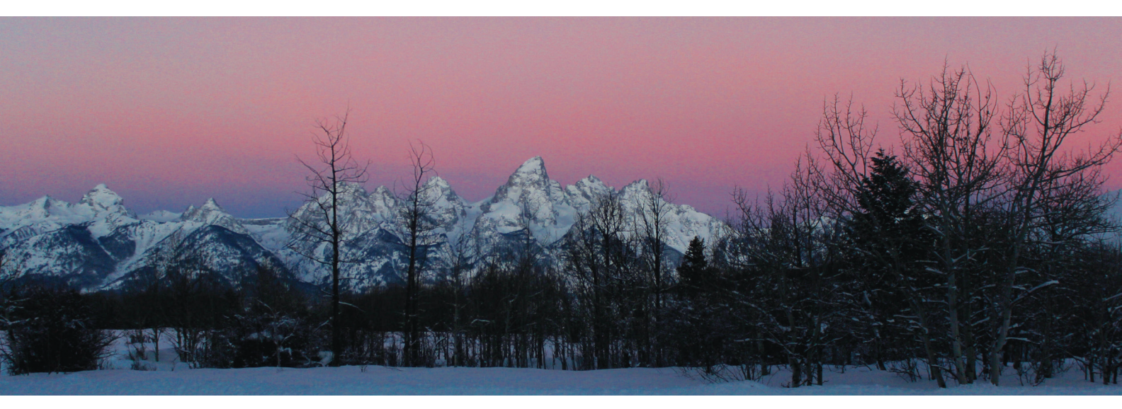
Grand Tetons at sunrise, Grand Teton National Park. | ANA HOUSEAL

These fundamental concerns aside, the total economic value of a national park has been assessed at least partially by determining the total amount of money that tourists collectively are willing to pay in order to visit a park (Clawson and Knetsch 1966; Champ, Boyle, and Brown 2003). Social scientists not only measure the perceived value of a park or other places to those who visit, but also the option value of future visits (the amount of money people would be willing to spend to keep the option for themselves of visiting a national park). They also