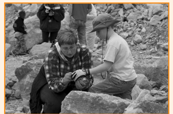
Participants in Fossils Around Town examine a specimen.

"I had an opportunity to see first hand what a geologist sees when studying volcanoes and the effects they have on nature. I interacted with a dynamic group of educators and scientists." -Adult participant, Science of National Parks: Hawaii Volcanoes National Park