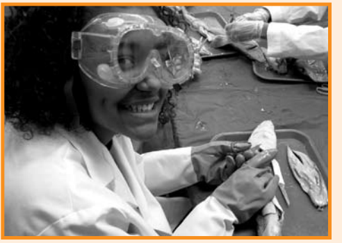
A YFS teen dissects a shark.

"I learned that a hawk's beak is short and very sharp. I never saw a hawk beak up close." - Child participant, Summertime Science