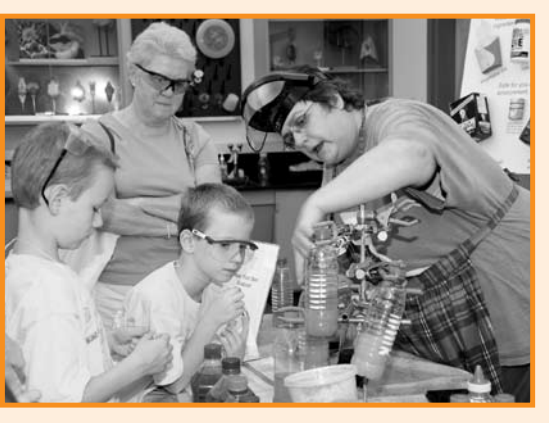
At Algae Palooza, a member of the St. Louis Renewable Energy Club helps young scientists make biodiesel.

"I've studied chemistry at school but this was awesome and it's amazing how it made me realize things I've not noticed before." - Adult participant, Amazing Science Demonstration: Rainbow Chemistru