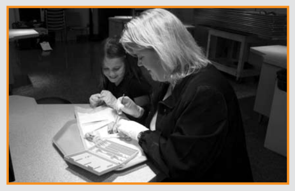
A mother and daughter dissect a sheep brain during Family Med School Labs.

Participants also described long-term benefits of their Family Med School experience including healthier habits, an increase in and improvement in the quality of science discussions, improved academic performance for their children, and increased interest in science careers. One respondent summed up the overall impact saying, "You helped break down the barriers to understanding science." Family Med School suggests a promising model for bringing adults and children together around authentic experiences with science.