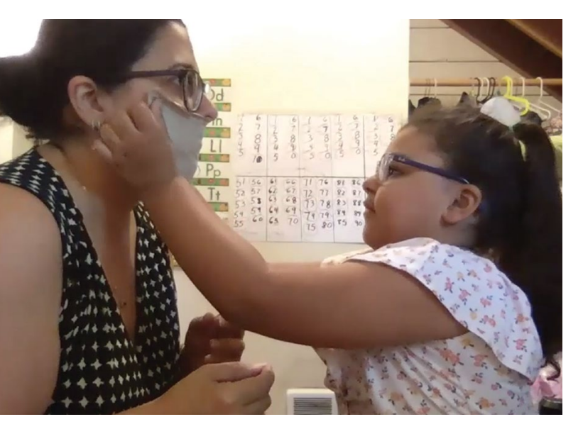
Figure 4 | A child explores how a mask fits her mother in a virtual mask-making workshop.