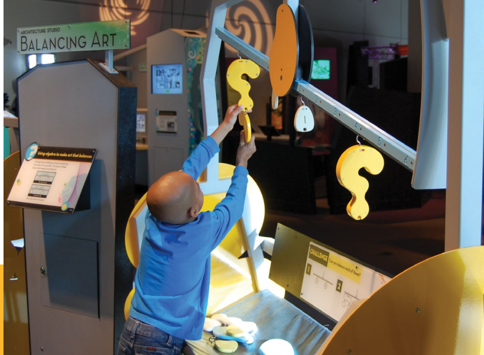
Figure 1 Mobile sculpture exhibit highlighting the multiplicative relationship among weight, distance, and force on each side of the fulcrum.

As an example, first imagine that a middle school math teacher is working on a lesson on algebraic relationships. She has introduced the idea of balancing the two sides of an equation and is looking for a way to make this concept more intuitive. At the local science center, she saw a mobile sculpture exhibit that encouraged visitors to explore the multiplicative relationship among weight, distance, and force on each side of the fulcrum (see Figure 1). Working with educators from the museum, the teacher builds a smaller version of the balancing exhibit, with the distances and weights clearly marked so that her students can experiment with different weight-distance combinations. She even introduces the idea of a "mystery weight" that students must "solve for," using the other weights in the balanced configuration. Through the process, the students engage in rich conversations about equations, variables, and multiplicative relationships.