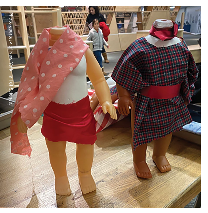
Figure 3 | Mannequin dolls for the fashion design activity at NYSCI

Making these changes to the weaving activity at CMP helped us identify two promising design strategies for authentically integrating math and making: