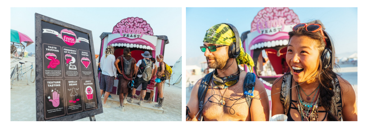
Fig 3a and 3b: Fig 3a. (left) - Guerilla Science Flavor Feast pop up, Burning Man festival 2017 (Image by Galen Oakes.). Fig 3b (right) - Miracle berry pills cause lemons to taste sweet. An experience that many guests find surprising and exciting. (Image by Galen Oakes.)

The data reveals that the impact of deploying interactive experiences that borrow elements from art, design, performance, and music, infusing the experiences with science content, and installing the experiences in informal settings such as music festivals activates those latently interested in science to engage with science; this is precisely because the context and style of activity helps audiences shift their perspective away from being educated about science to engaging in a cultural experience that happens to have some science content.