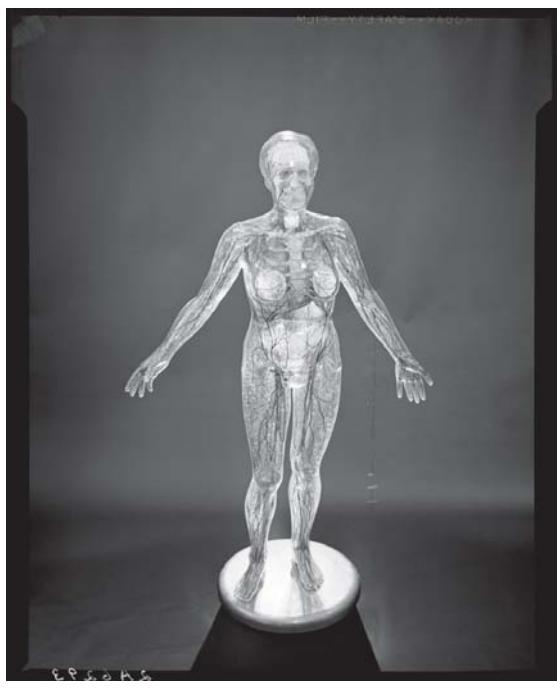
Fig 4: Here featured at the AMNH in 1954, the Transparent Woman display could be found in museums all over the United States. Neg. #2a6293; American Museum of Natural History Photographic Print Collection.

Older natural history museums responded by installing similar or identical exhibits of their own. For example, the Smithsonian introduced a series of life science displays that had no connection to the research work of its natural history curators but nevertheless explored subjects that interested the public. In 1957, a new 'Hall of Health' was opened in the Arts and Industries building, the centrepiece of which was a 'Transparent Woman', mimicking exhibits popular in Europe in the 1930s. Using electronic sound and light, this figure demonstrated (in hourly guided 'performances') the function of the major organs and systems of the human body. The AMNH