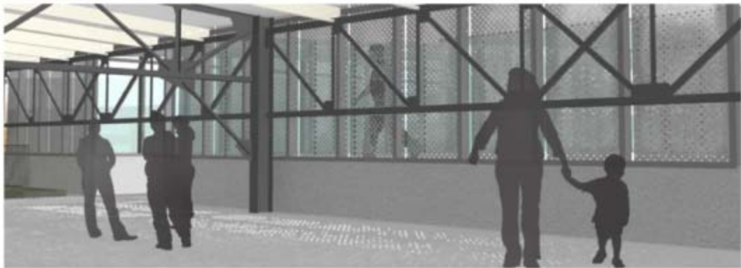
EXPLORATORIUM— Observatory Terrace