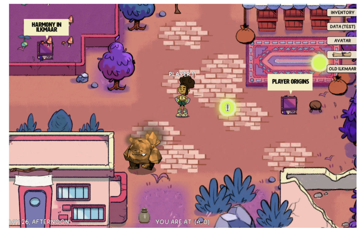
Fig 1. Game screenshot.