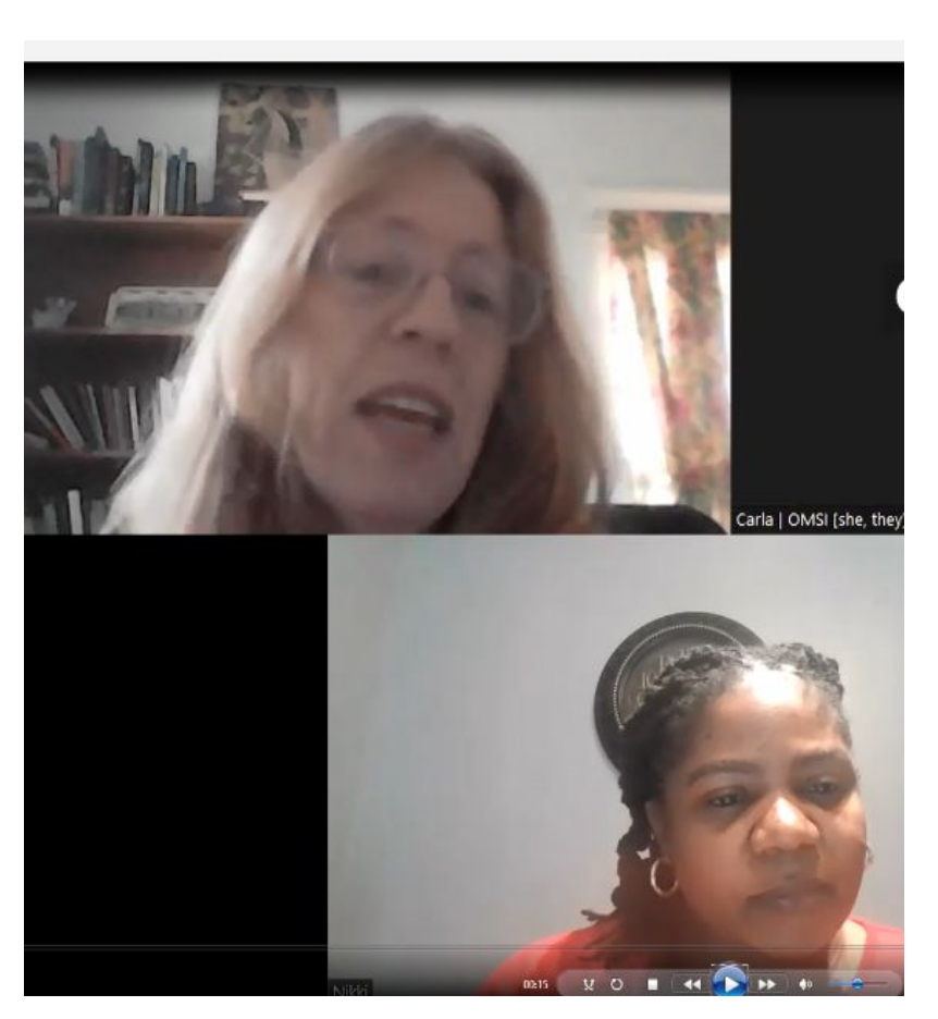
DOT Storytellers and Active Audience Members