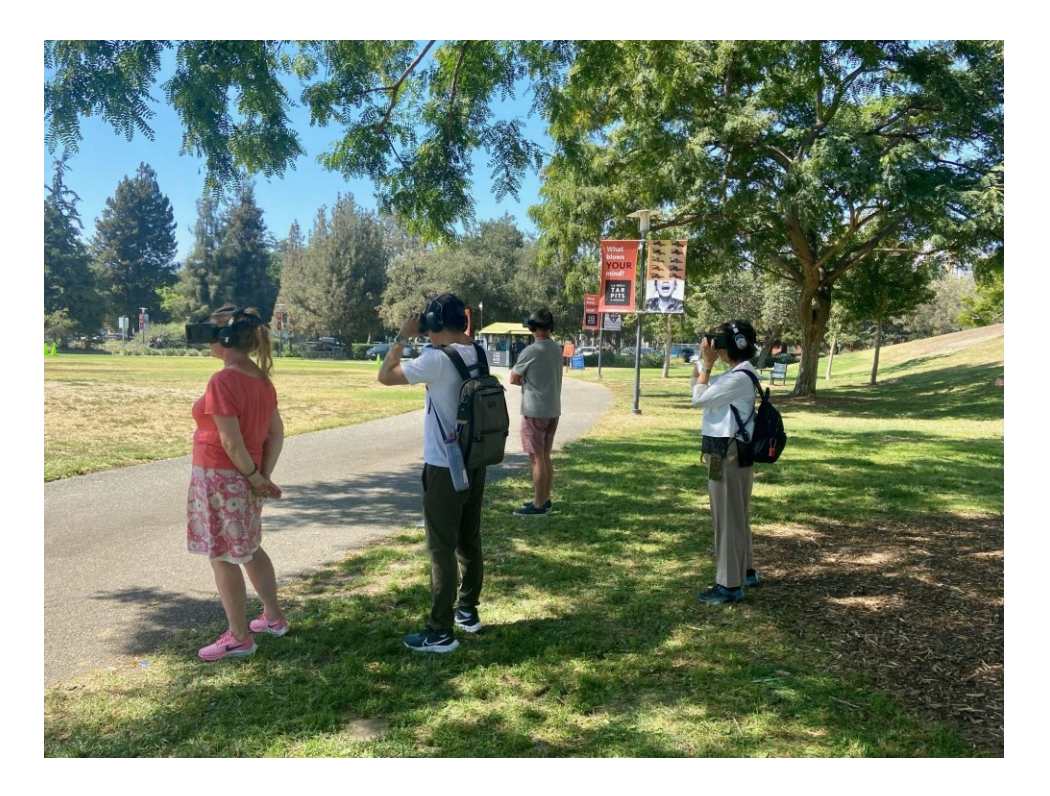
(Nye et al., 2023)

Though visitors' learning increased in each condition, data resulted in little difference between the learning gains with AR and with the more traditional, didactic sign. Other benefits to AR were noted, however, raising new questions about the impacts of XR on museum audiences. Is XR still valuable to museums, if lower-cost and -maintenance tools teach just as well?