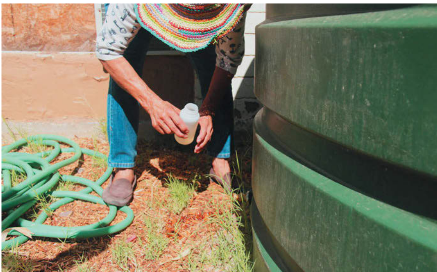
Figure 7. Trainee collecting a harvested rainwater sample from one of the five 1,500 gallon cisterns Project Harvest installed as part of their community building efforts in Arizona.

As outlined by May et al. (2003), knowledge mediators bridge communities in two ways: horizontally, by facilitating social networks within the community; and vertically, by connecting targeted residents with researchers or critical services from outside the community. These “bridging acts” are critical for environmental health education efforts, as they connect ethnically diverse community groups with environmental health information. These groups can then make informed choices to reduce health risks, improve quality of life, and protect the environment.