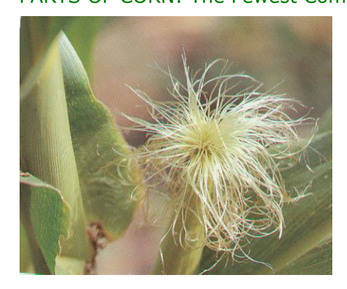
PARTS OF CORN: The Fewest Comments

People knew the least and had the fewest questions about the parts of corn. Some people said they didn't know about this or knew a little but would like to know more, or were curious about "how it works." Aside from "detasseling," visitors used few specialized vocabulary words to describe corn parts.