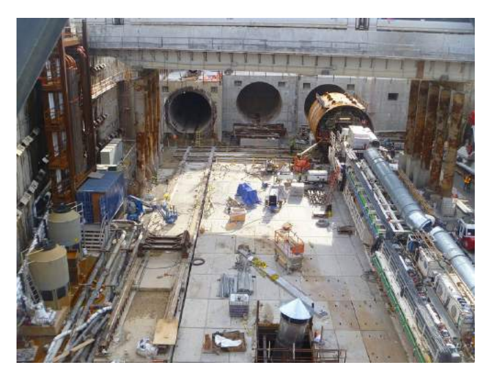
Figure 12. Tunnel Boring Machine