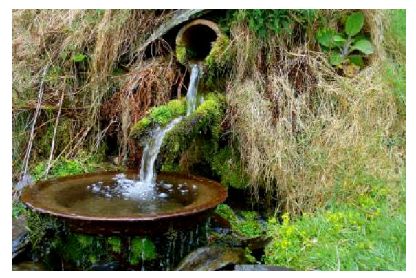
Figure 34. Mountain Spring

April 14, 2008. Used with permission under Creative Commons.