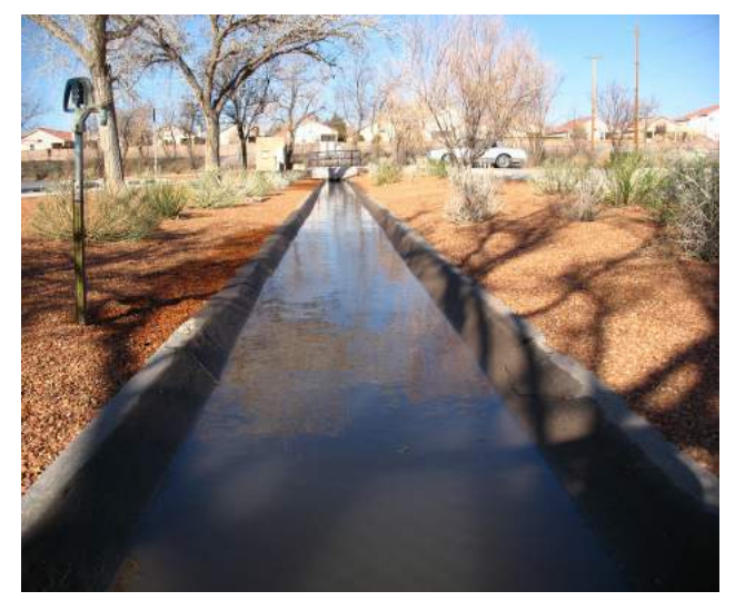
Figure 50. Irrigation

March 14, 2008. Used with permission under Creative Commons.