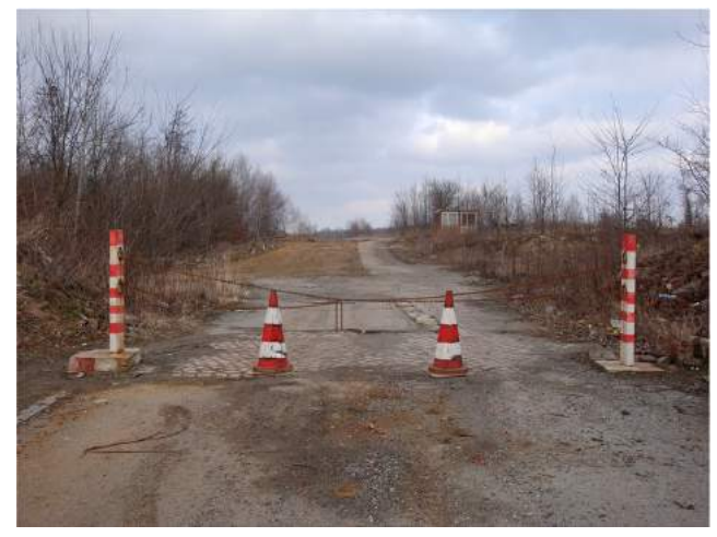
Figure 2. Restricted Land

Pavel P. February 26, 2014. Used with permission under Creative Commons.