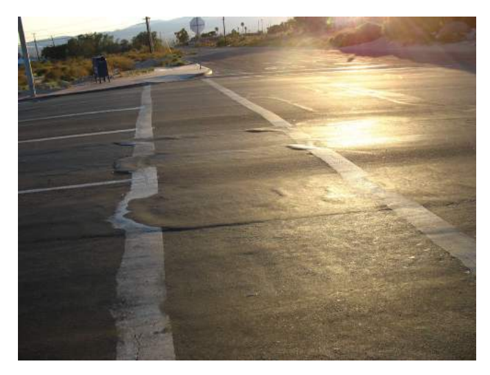
Figure 26. Melted Streets

Urban heat islands are created when city growth alters the urban fabric by replacing forest with manmade features, such as asphalt roads and tar roofs. Trees provide shade and cool the air through evaporation, but the hard, dark surfaces that replace them store heat during the day. This heat is released at night, so that both the highest and the lowest temperatures in the city are elevated relative to the surrounding rural areas.