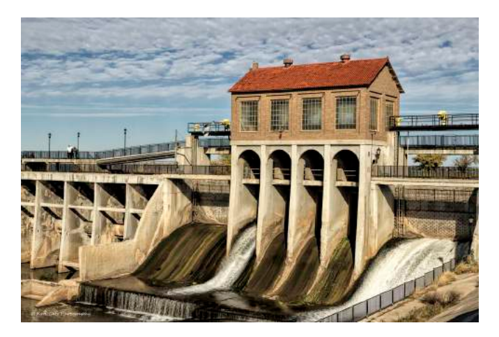
Figure 53. Dam

Many cities were founded on waterways, but today, the unpredictability and intensity of flooding has made these locations more challenging to live in than in the past. Floods can cause extensive property damage and make it difficult to maintain normal urban functions. Large-scale engineering projects, like dams, are essential to control the movement and availability of water and these projects must be implemented in an environmentally sensitive fashion to minimize harm and maximize benefits.