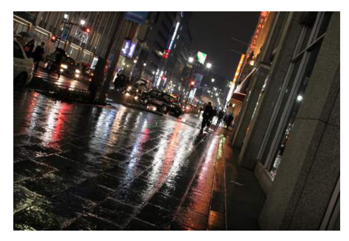
Figure 24. Raining Night

The water cycle, also known as the hydrological cycle, is the continuous exchange of water between land, water, and the atmosphere. Impervious surfaces associated with urbanization alter the amount of water that takes each route. The consequences of this change are a decrease in the volume of water that permeates the ground and an increase in volume and decrease in quality of surface water. These hydrological changes have significant implications for the quantity of fresh, clean water that is available for use by humans, fish, and wildlife.