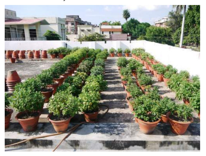
Figure 27. A Roof Covered in Plants

Barry Pousman. August 29, 2011. Used with permission under Creative Commons.