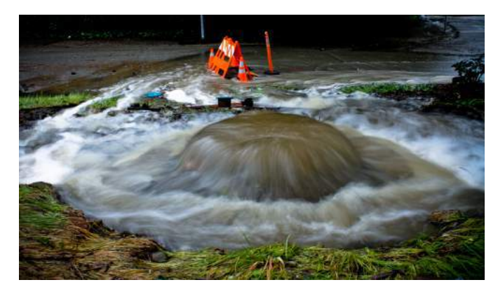
Figure 28. Sewer Overflow

When stormwater is absorbed into the ground, it recharges the water table, and replenishes aquifers. In developed areas, however, impervious surfaces such as pavement and roofs prevent precipitation from soaking into the ground. Instead, the water runs rapidly into storm drains, sewer systems, and drainage ditches.