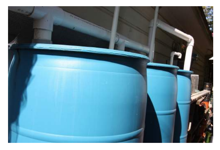
Figure 39. Urban Rainwater Barrels

An integrated urban water resource management plan covers the entire urban water cycle, including rainwater, desalination, ground and surface water, storage and distribution, treatment, recycling, disposal, use, water loss, and protection and conservation of water resources. This approach draws on the diversity of water management options available to urban planners, including the built infrastructure as well as the natural landscape. Managing human water use allows cities to conserve the quantity and quality of freshwater as well as the terrestrial ecosystems that provide services to humans and all living things. When it is most successful, this approach creates more sustainable livelihoods in cities and empowers communities to be involved in ensuring access to safe water and hygienic living conditions.