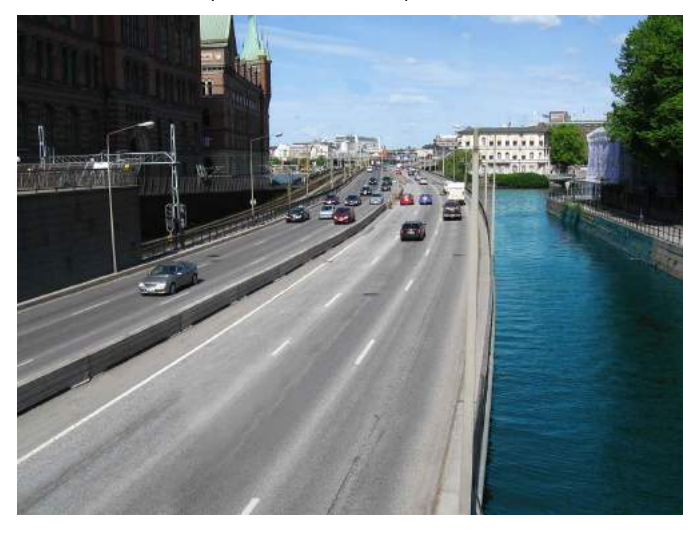
Figure 48. Bridge Next to an Urban Waterway