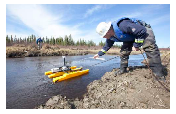
Figure 22. Water Monitoring