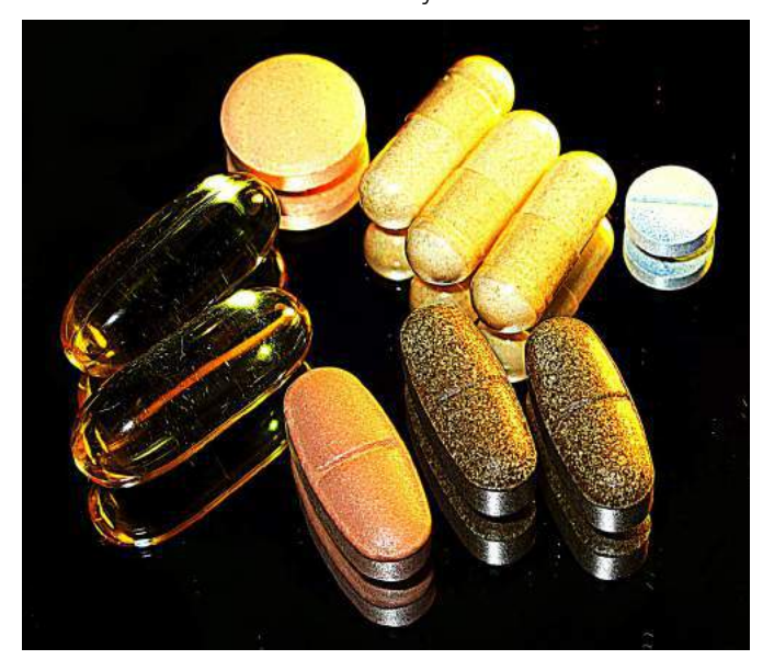
Figure 11. A Variety of Pharmaceutical Pills

• How do the concentrations of pharmaceuticals differ in river water and well water? Why?