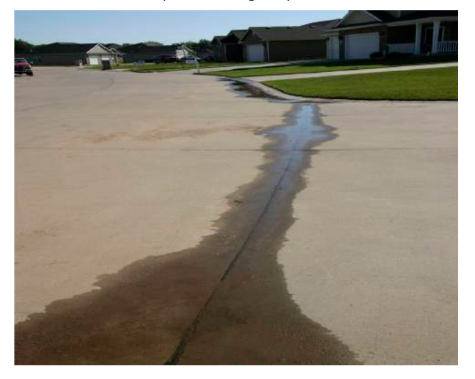
Figure 38. Water Leak

Joshua Works. September 2, 2007. Used with permission under Creative Commons.