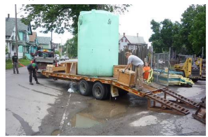
Figure 40. Rainwater Collection Tank

8. Controlling water demand and use is crucial an integrated water management strategy and is as important as physically managing the flow of water. Providing incentives to reduce water consumption, such as compensating for removal of water guzzling landscaping can be an effective approach.