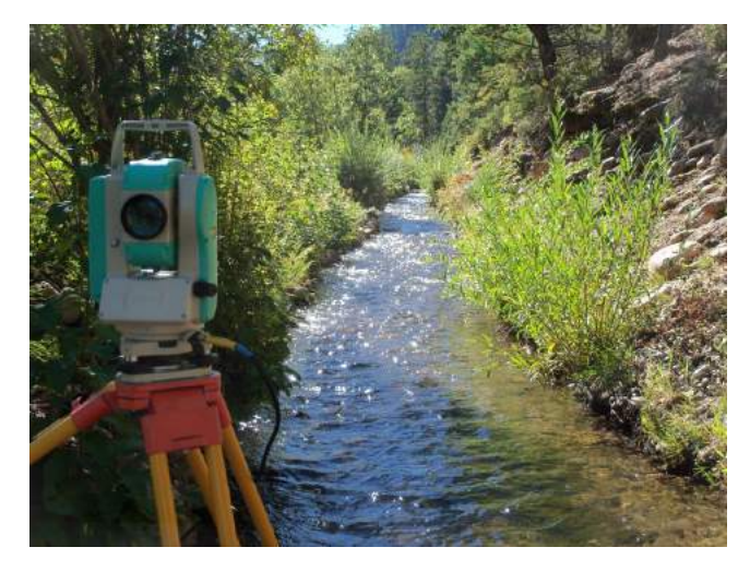
Figure 21. Surveying Methods

Material Flow Analysis (MFA) is the quantification and assessment of the movement of materials (e.g., water, food, excreta, and wastewater) and chemicals (e.g., nitrogen, phosphorus, and carbon) in a defined ecosystem. MFA tracks the path a material or chemical takes through the system.