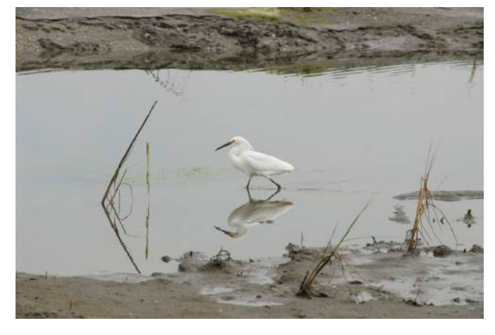
Figure 45. Animal Life at a Restoration Site

March 29, 2011. Used with permission under Creative Commons.