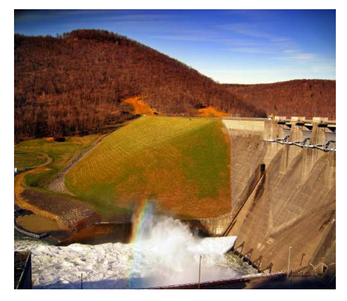
Figure 51. Dam

A sustainable urban water supply has become more important as increasing consumption and contamination reduce the availability of clean water. Urban areas must identify new sources of water and reduce the environmental pollution that is threatening existing supplies. A sustainable water plan will include reductions in water use, better environmental regulations and enforcement, and minimal system leakage. Although US cities are beginning to address these problems, they have a lot to learn from water supply networks in developing countries, which have dealt with population increase, water scarcity, inadequate infrastructure, and environmental pollution for many years.