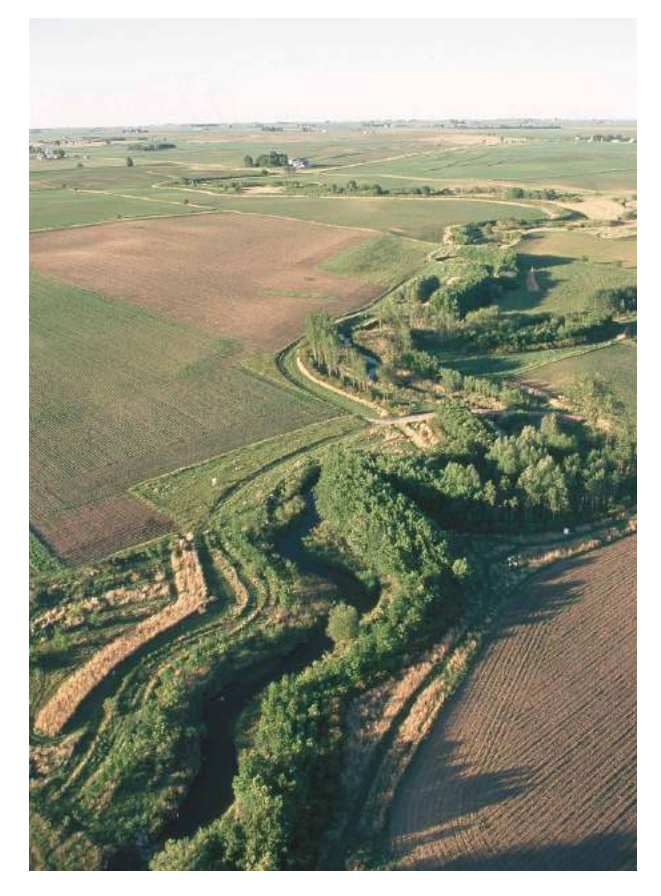
Figure 13. Riparian Habitat

The riparian zone is the interface between the land and a river or stream running through it. Riparian habitats are the types of habitats found along the banks of a river or stream. Riparian habitats may be on land (terrestrial), in the water (aquatic), or at the water's edge (littoral). These habitats are of great value for local wildlife and plants, typically containing many more species than the surrounding lands.