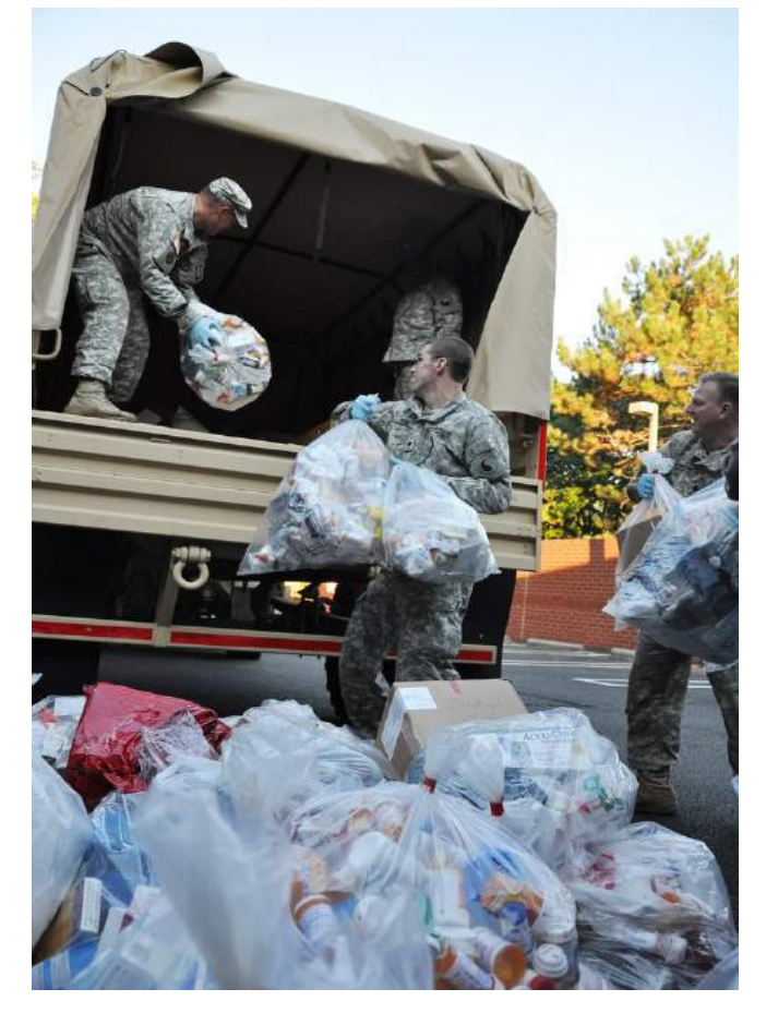
Figure 10. Virginia Guard Assists DEA in Drug Destruction

Pharmaceuticals are synthetic chemicals from many different chemical families. People use many thousands of types of drugs, so it is almost impossible to sufficiently study the myriad interactions that may occur in the environment and how humans and nature may be affected by all these chemical interactions.