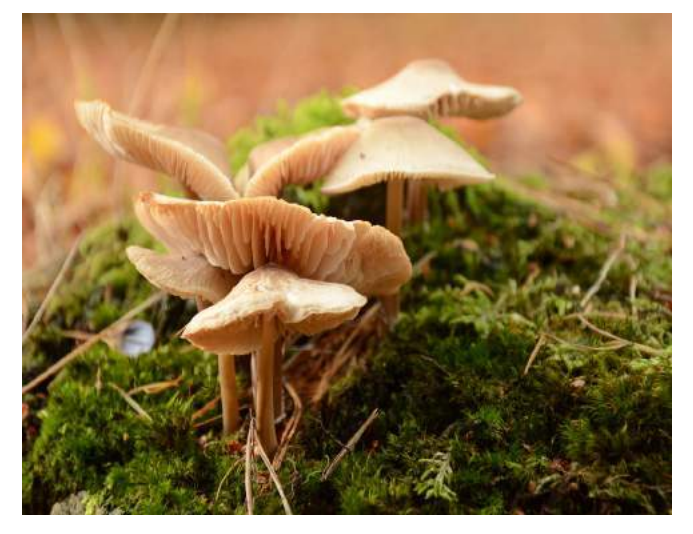
Figure 20. Mushrooms

Rene Mensen. October 27, 2013. Used with permission under Creative Commons.