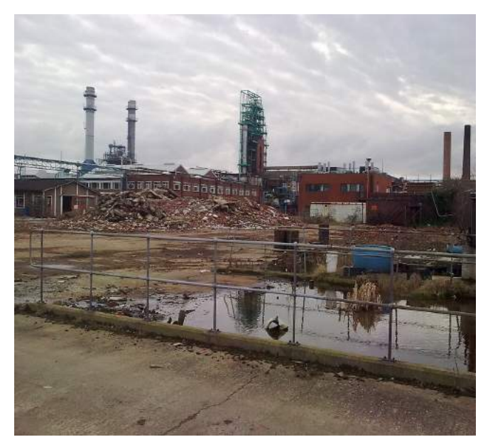
Figure 1. Engineering at a Brownfield Contaminated Site

Brownfields are abandoned or idle tracts of land that were used previously for industry or manufacturing and are now contaminated with low concentrations of hazardous substances. The contaminant (e.g., petroleum) poses a risk to human health or the environment, but expansion or redevelopment is possible once the substances are treated or removed.