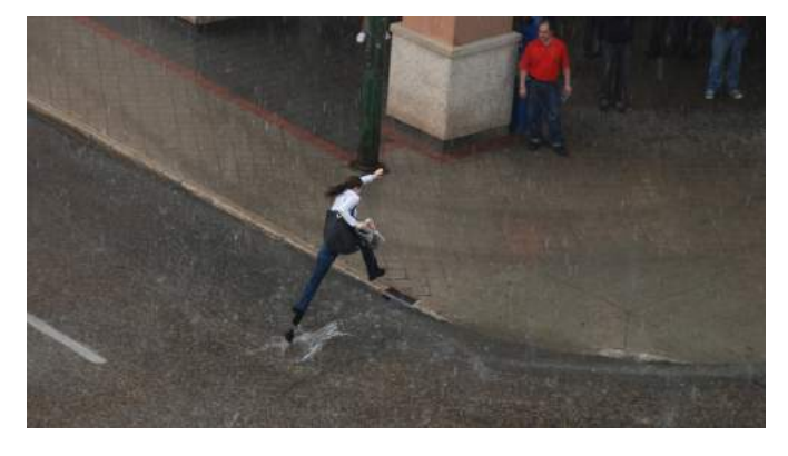
Figure 25. Flooded Street Corner