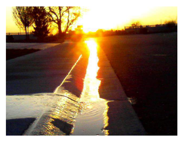
Figure 46. Water Runoff

In general, urbanization and agriculture decrease the health of the waterways by clearing plants from stream banks, changing the path and quantity of runoff, altering the shape of streams, furthering erosion, and introducing pollutants and nutrients. Many urban communities are making efforts to address these problems and improve the health of local waterways.