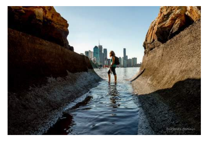
Figure 30. Outflow

March 25, 2014. Used with permission under Creative Commons.