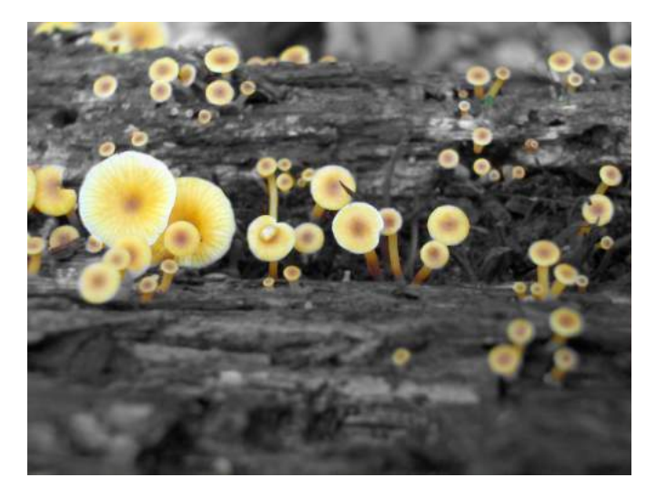
Figure 18. Fungi

Nutrient cycling describes the use, movement, and recycling of chemical nutrients in the environment. In an urban setting, there are many forces that directly and indirectly alter nutrient cycling processes and have consequences for health of natural biodiversity, urban tree health, water quality, pet waste disposal, and water runoff patterns.