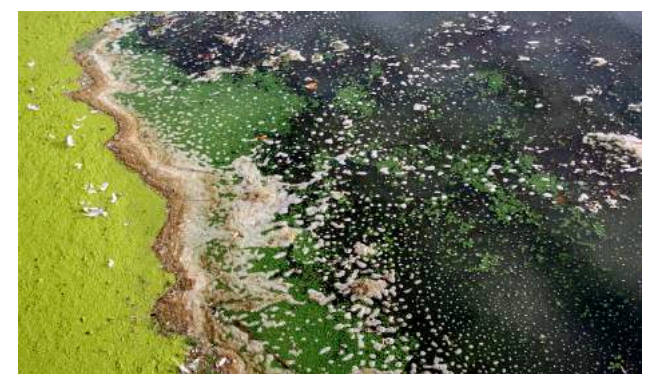
Figure 47. Algal Bloom

August 22, 2010. Used with permission under Creative Commons.