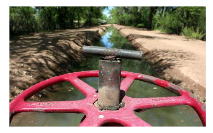
Figure 49. Water Distribution Channel

Watershed management generates many legal and political issues as organizations and individuals create and implement plans and projects to sustain and enhance watershed functions. Legal and political conflict is evident when competing interests seek to determine who gets how much water, of what quality, where it should drain, how to handle stormwater runoff, how to settle claims to water rights, and how to use and maintain waterways. Landowners, land use agencies, stormwater management experts, environmental specialists, water use surveyors and communities all play an integral part in watershed management.