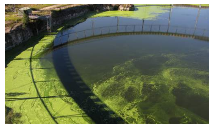
Figure 42. Water Eutrophication

processes take place. CSOs are a key problem in increasing organic matter in urban waterways because untreated sewage is directly discharged into waterways.