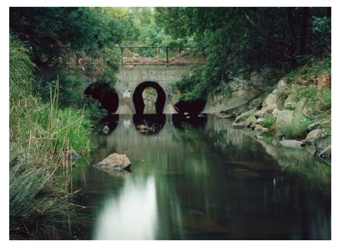
Figure 33. Urban Stormwater Drainage

April 6, 2011. Used with permission under Creative Commons.