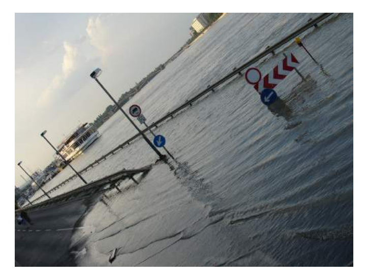
Figure 41. Flooding

Urbanization changes the physical, chemical and biological environment in our waterways. Physical changes include altering riverbank structure, waterway channel, flow rate, turbidity, and wastewater inputs. Erratic and massive stormwater runoff events can trigger changes in water and sediment quality, water temperature, and hydrology, which in turn affect habitat diversity and resources available to the waterway species.