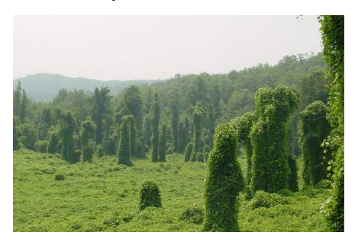
Figure 15. Kudzu

An invasive species is a non-native species whose introduction by humans and subsequent massive population growth may cause harm to the economy, environment, and human health.