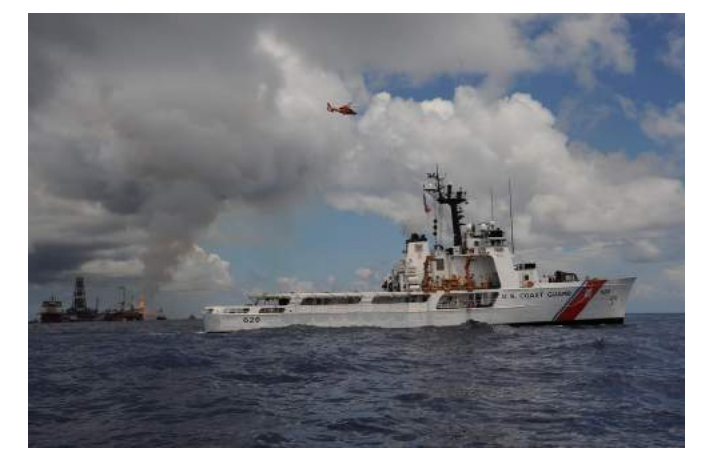
Figure 5. Deepwater Horizon Response

• Do you live near a community that takes drinking water out of the waterways? Would you feel more or less safe about the presence of pollutants if the water comes from a natural river or from a constructed waterway like Central Canal?