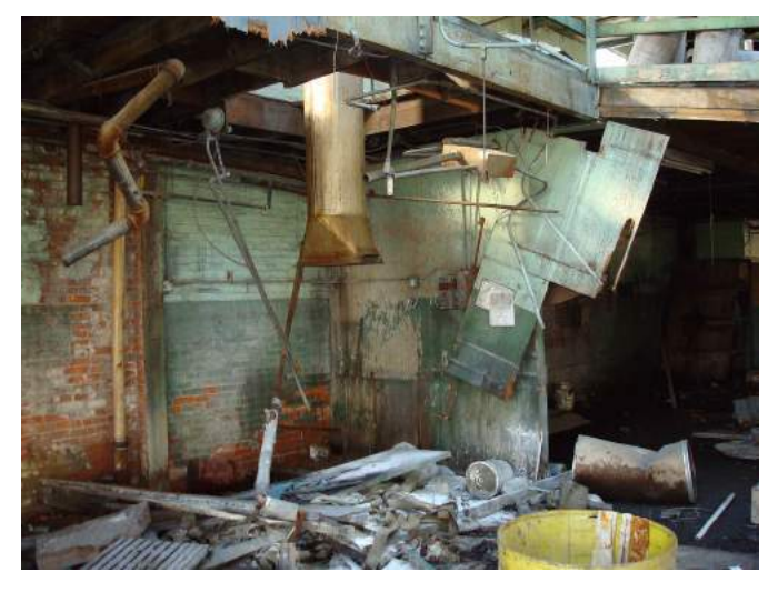
Figure 3. Ohio Redevelopment Projects

United States Environmental Protection Agency. (2014). Brownfields and Land Revitalization. http://www.epa.gov/brownfields.