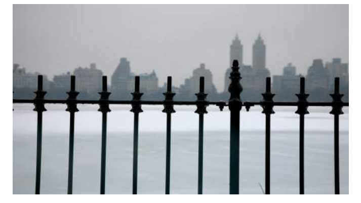
Figure 37. Urban Reservoir

Vincent Desjardins. February 2, 2011. Used with permission under Creative Commons.