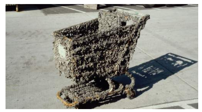
Figure 16. Zebra Mussels on a Shopping Cart

USFWS Pacific Region. September 26, 2012. Used with permission under Creative Commons.