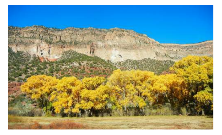
Figure 14. Riparian Strip Cottonwoods

Lou Feltz. October 27, 2013. Used with permission under Creative Commons.