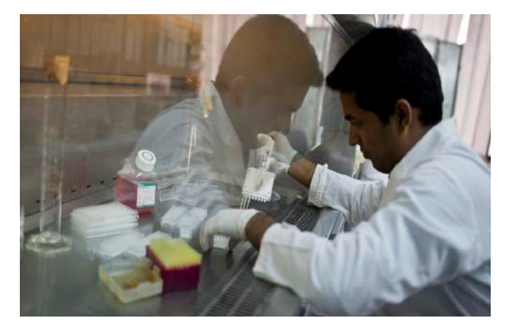
Figure 9. Working on a New Cholera Vaccination

Oram, B. (2014). Water Testing Bacteria, Coliform, Nuisance Bacteria, Viruses, and Pathogens in Drinking Water. Retrieved from http://www.water-research.net/index.php/bacteria.