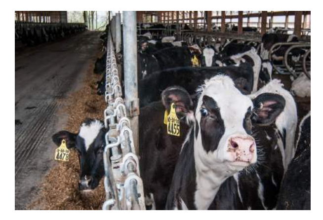
Figure 6. Large Scale Farming USDA. April 19, 2011. Used with permission under Creative Commons.