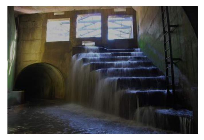
Figure 31. Stormwater Interceptor Aug 7, 2009. Used with permission under Creative Commons.

US Environmental Protection Agency. (2012). Greening EPA: Stormwater Management. Retrieved from http://www.epa.gov/greeningepa/stormwater/.