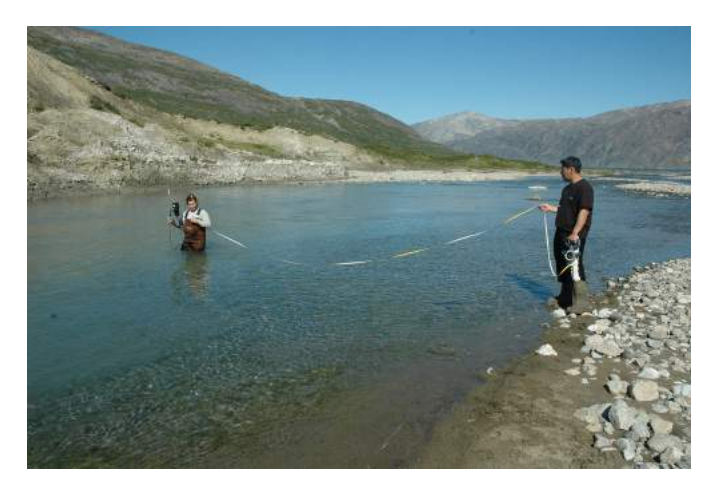
Figure 23. Measuring River Flow

Yiougo, L.S.A. and Spuhler, D. (2015). Material Flow Analysis (MFA). Sustainable Sanitation and Water Management. Retrieved from http://www.sswm.info/content/material-flow-analysis-mfa.