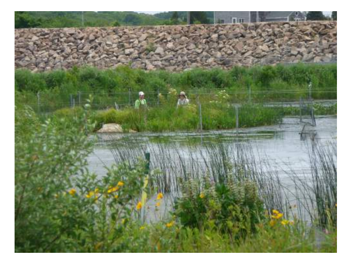
Figure 44. Wetlands Restoration

Restoration is the effort to reestablish the pre-disturbance physical, chemical, and biological characteristics of a waterway and the related functions. The ultimate goal of stream restoration is to return the stream to its original undisturbed condition. Restoration efforts should also increase the diversity and population size of waterway plant and animal species.