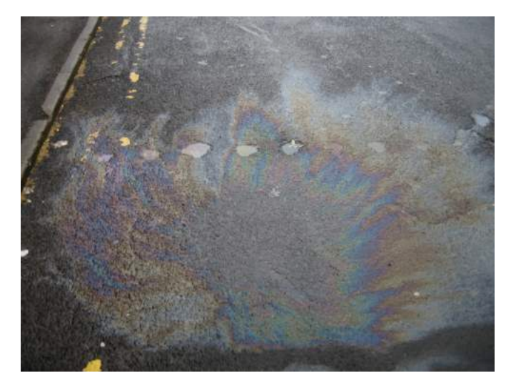
Figure 32. Oil on Pavement

Human activity commonly affects the distribution, quantity, and chemical quality of water resources, and this is particularly acute in urban areas. These actions will typically reduce the amount of water that makes its way into the water table, resulting in a slower movement of water into aquifers. The net result is that there will be less and lower-quality groundwater for humans and the environment.