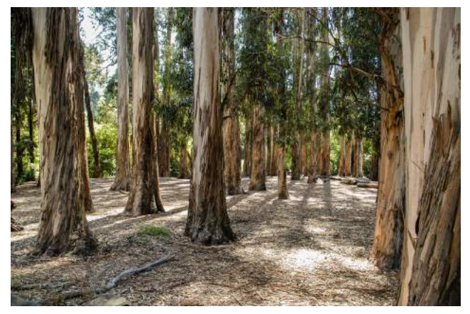
Figure 17. Eucalyptus Grove