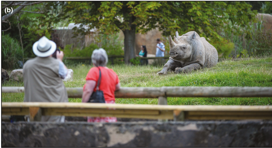
Figure 1. Biodiversity education in a zoo setting. Visitors (a) receive biodiversity information via a tablet and (b) viewing an eastern black rhino (Diceros bicornis michaeli) at Chester Zoo, UK.