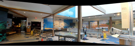
Interactive wave tanks allow for iterative build-and-test activities among family groups.

Different research platforms using the underlying Cyberlab data collection system help answer fundamentally different research questions addressing the different nature and usability of the platforms themselves.