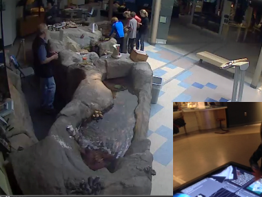
Touch tanks allow for research on interactions with live animals.