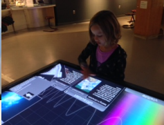
Multi-touch table allows for research on interactions with digital interfaces.