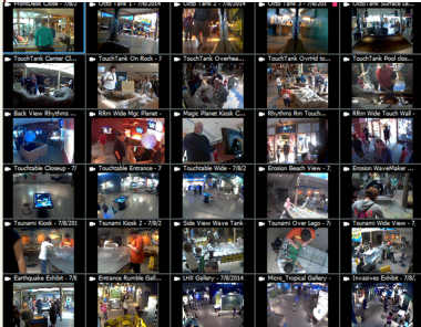
Milestone video surveillance software allows researchers to fine-tune data collection.

Cyberlab represents a "social science" model of remote data collection. Oceanographers collect remote data from the ocean using satellites. Cyberlab collects remote data from a social learning setting through cutting edge video technology that goes beyond surveillance.