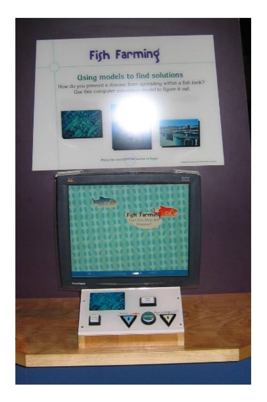
Figure 11: Close-up of the Fish Farming interactive as displayed in Making Models

yellow triangle button that is also pointing down. Above these buttons is a rectangular shaped button that reads "Start Over." Figure 11 provides a close-up of this interactive.