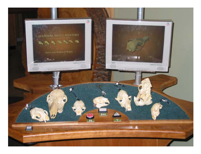
Figure 10: Close-up of Mammal Skull Mystery

they are asked a series of questions about their skull. Images of different types of skulls are provided to assist visitors in answering the questions. Figure 10 provides a close up of the starting screen and the button layout for the interactive.