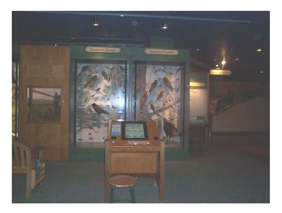
Figure 4: "A Bird's World" combined touchscreen and push button interface