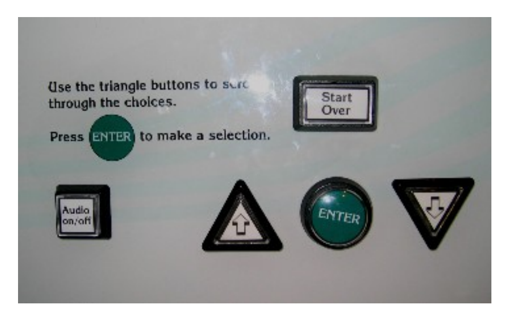
Figure 2: An example of a more recent Museum of Science computer interface

Modifications have also been made to the design based on the varying needs of the interactives themselves. In some cases, new interactives did not require visitors to scroll through options as the programs only offered two choices (such as the "yes" and "no"). In these situations, the triangle keys were replaced with two buttons of different shapes so that the form of the interface better matched its function (see Figure 3).