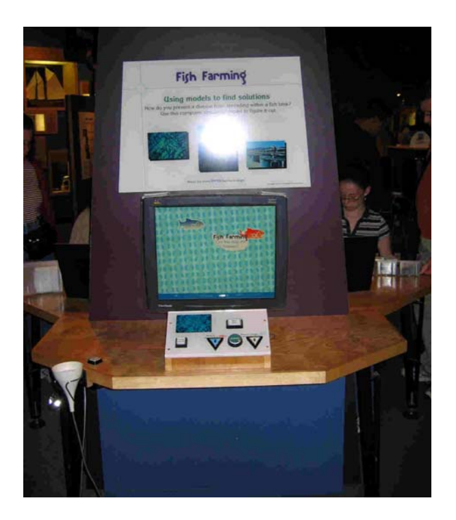
Figure 6: Slanted console for buttons used in "Making Models"

Design elements outside of the user interface are also essential to providing universal access. For example, easily moved stools placed near the computer interactive ease the comfort of many visitors. Visitors who have limited mobility but do not use a wheelchair (such as older adults) report that stools greatly increase their comfort level in science center exhibitions (C. Reich & Borun, 2001). Stools also help adults with lower back pain as they use computer interactives designed for the height of wheelchair users, and provide an opportunity for visitors with low vision to get close to the computer screen without fear of "sticking their butt out" into the pathway of other museum visitors. Evaluation findings also suggest that stools increase visitor dwell time at all interactive components.