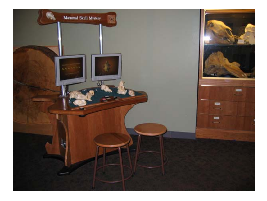
Figure 9: Mammal Skull Mystery interactive as presented in Natural Mysteries

would notice a semi-circular dome hovering above that projects Native American music into the gallery. On the table, directly in front of the array of skulls, at the center most point of the semi-circle, are three arcade-like buttons. To the left of center is a red oneinch in diameter circle button with a raised N beneath. To the right of center is a green triangle button with a raised Y beneath it. Above both of these buttons is a 2-inch long rectangular button with a raised symbol beneath it. This symbol consists of a straight line followed by two backward facing triangles, similar to the one used to designate "rewind" on a VCR. At the far-left corner of the table sits a one-inch square button that reads "audio text." Figure 9 provides an image of this interactive, shown with the adjacent skull case that houses real mammal skull specimens.