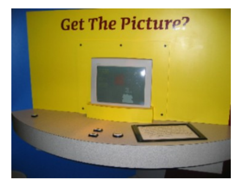
Figure 1: Early implementation of the Museum of Science interface

the University of Wisconsin-Madison (Vanderheiden, 1999). Surprisingly, these two systems were developed in parallel, and the Museum of Science staff did not learn about the EZ Access interface until after the first implementation of the push-button interface in the Messages exhibition.