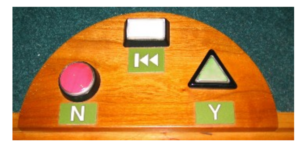
Figure 3: An example of the Yes or No computer interface

Modifications have also been made to the design based on the varying needs of the interactives themselves. In some cases, new interactives did not require visitors to scroll through options as the programs only offered two choices (such as the "yes" and "no"). In these situations, the triangle keys were replaced with two buttons of different shapes so that the form of the interface better matched its function (see Figure 3).