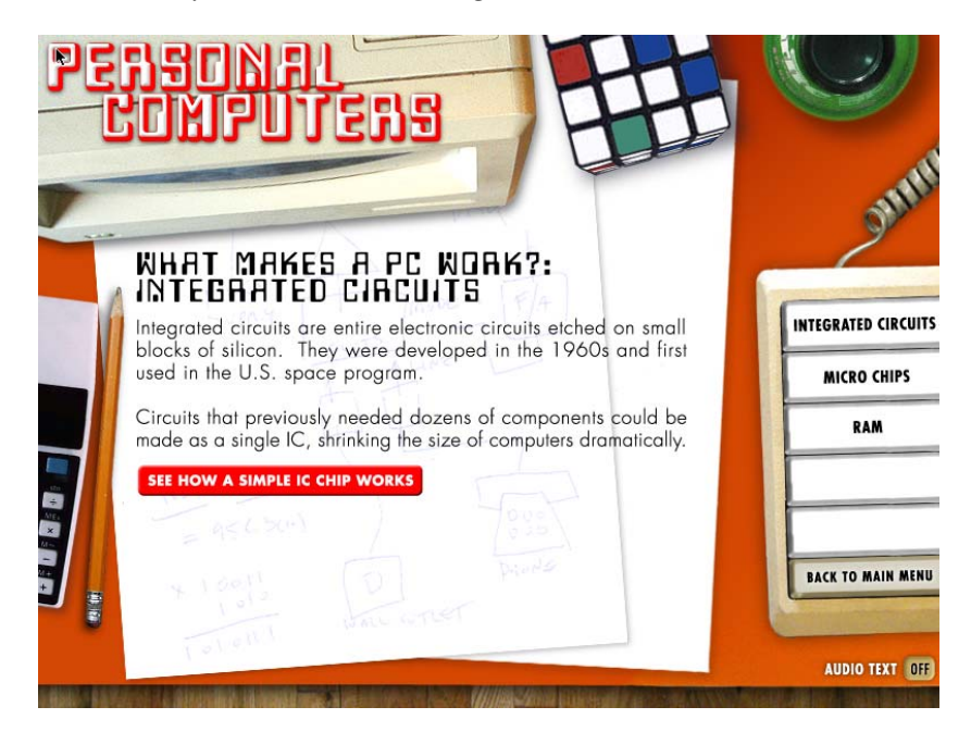
Figure 12: Personal Computer screen that was difficult for participants to navigate

One affordance a touchscreen has that the button interface does not is that with a touchscreen, there is a direct connection between the users' physical action and the selection they make on the screen. In comparison, with the button interface, there is a physical disconnect between the users' physical actions pressing the buttons on the console and the visual feedback delivered by the screen in response to that action. The