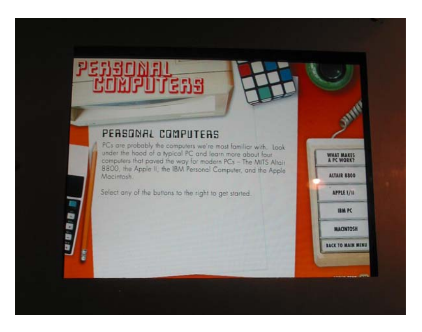
Figure 8: Close-up of the Personal Computers screen

right-hand side of the screen. Visitors use the triangle buttons to scroll through the menu options. Each time a visitor presses a triangle button, one of the menu choices is highlighted in pale green and read aloud by a female voice if the audio text is on. If they would like to learn more about one of these menu choices, they can press the large circular button to select it. To the left of the menu tree is a block of text with supportive images. If the audio text is on, visitors also hear this text read aloud, again, by the same female voice. Any informational videos are also presented in this area. Figure 8 presents an image of one of the Personal Computers menu screens.