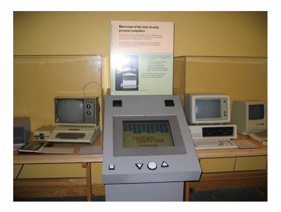
Figure 7: The Personal Computers interactive as presented in Computing Revolution

As described above, "Personal Computers" is a computer kiosk that provides interpretive information about the artifacts presented in the "PC highlights" case. This case presents four historic personal computers, including the Altair 8800, IBM PC, Apple II, and the Macintosh. The PC highlight case is divided into two separate sections, each presented on either side of the computer kiosk. In front of the kiosk is a circular stainless steel stool. The kiosk itself is a rather sleek design, with a black, white, gray and silver color scheme. The screen is presented along a 45 degree slanted surface with space for users to rest their arms on either side of the screen. Beneath the screen, along the same surface, are four buttons visitors can use to navigate the computer interface. These buttons include, in order from left to right, a one-inch square button labeled "audio text", a triangle with its apex pointing down, a circular button 2 inches in diameter, and another triangle with its apex pointing up. As visitors approach the interactive, they see the attract screen, which is a recreation of the 1980's video game "Breakout," along with the words "Press any key to begin." Once visitors begin the interactive, a menu appears on the